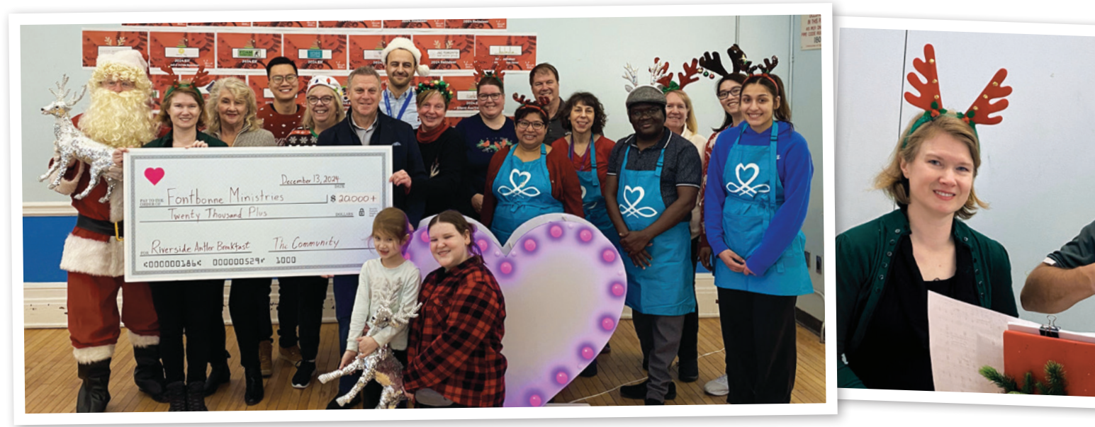
Santa and his team of holiday elves present the cheque that will make such a difference to our community.