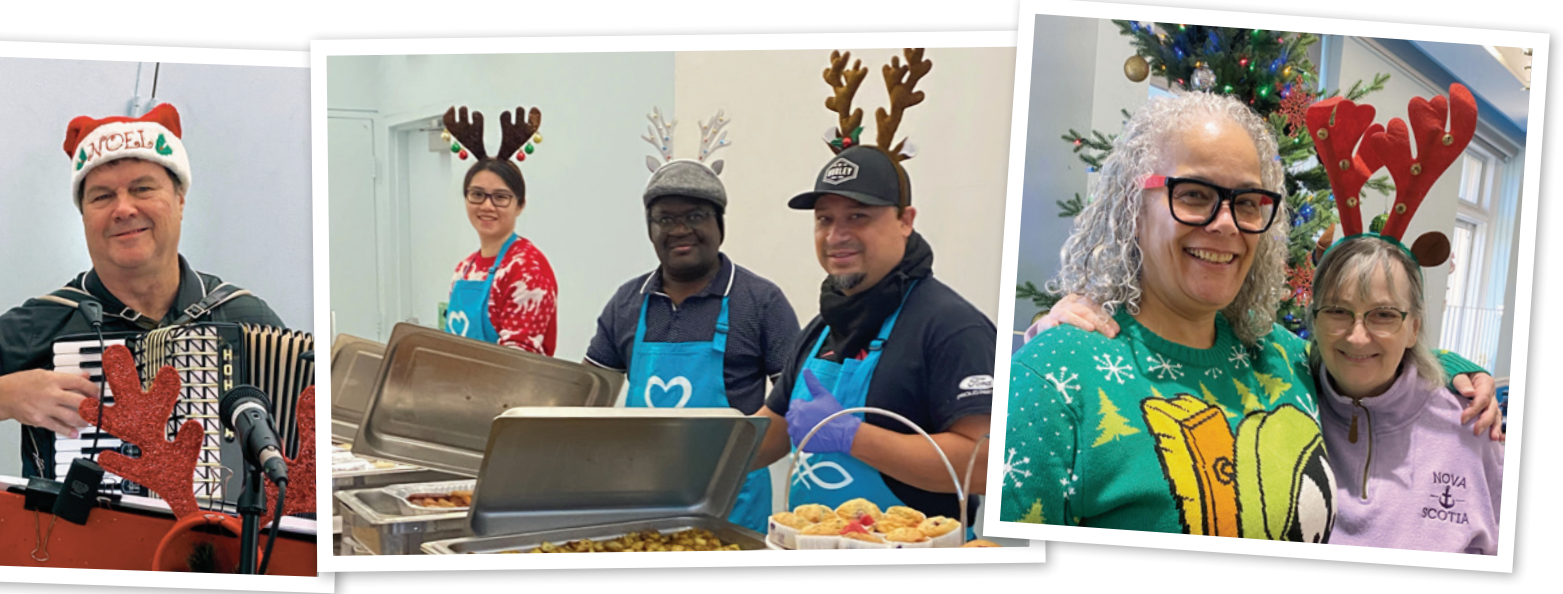
Fontbonne Ministries' talented team serve breakfast.